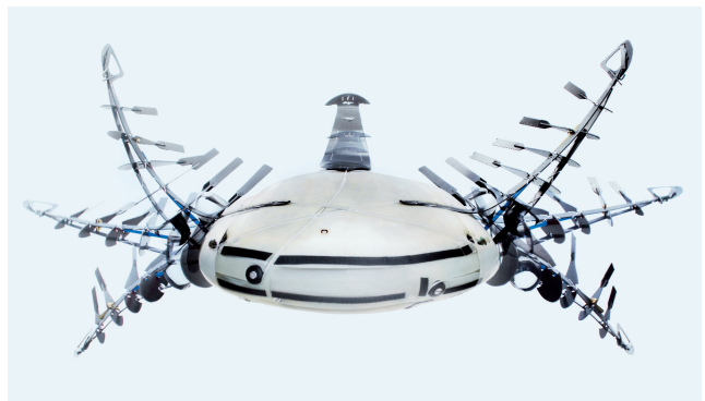
Aqua_ray without skin

Analysis of various types of movement through water has established that rays are perfectionists in submarine “flight” and gliding. The up-and-down motion of their flanks in water closely resembles the flapping of a bird’s wings in the air. This wavelike movement perfectly combines maximum propulsion with minimum energy consumption. The streamlined form lends graceful movement to the manta ray, in particular, and makes it a veritable submarine acrobat.