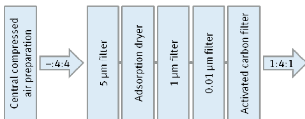
Filter cascade for compliance with class 1:2:1

The compressed air is used for transporting and mixing, as well as for food production in general. It comes into direct contact with the food. Because these foods are dry, even stricter requirements apply with regard to atmospheric humidity. Consequently, the following classification in accordance with ISO 8573-1:2010 is recommended in this case: Solid particles: class 1 Water: class 2 Oil: class 1